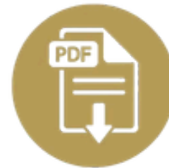
TEEN Orientation Packet